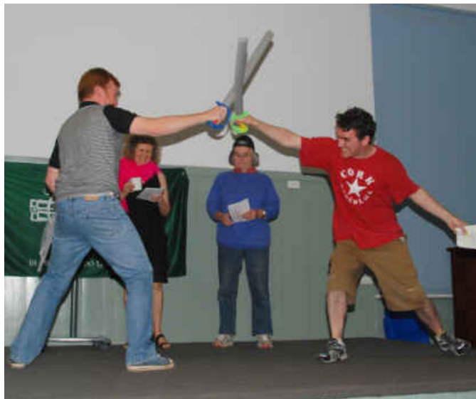
Ní raibh Clontarf mar seo ?

Tabhair freagraí dom chomh luath agus is féidir libh más maith libh Lá Seoltóireachta a bheith againn in