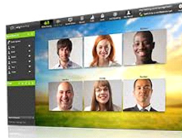
Ranganna ar líne le fáil anois ....leathanach 4

Beidh "Gala Dinner" agus Clár Comórtha Céad Bliain san Celtic Club. Beidh an Fhéile ar siúl san Edinburgh Gardens arís ar an 13ú Márta. Beidh stáinín eolais againn; labhair le duine ón gCoiste más